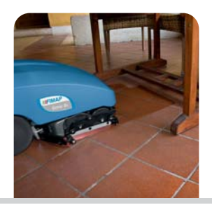
Genie Bs. Thanks to its front squeegee, it ensures drying in both directions

Genie removes dirt thoroughly unlike traditional mopping systems. Genie leaves floors perfectly dry, minimising high risk slip and trip accidents.