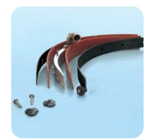
For excellent drying performance, the squeegee rubbers should be always be kept clean. When worn out, the squeegee rubbers are very easy to replace