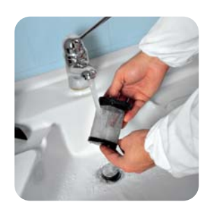
Simple and practical thorough cleaning of the suction filter

Cleaning and maintaining your Genie is effortless thanks to easy tank removal and filter access. The Genies high-quality components ensure long life and reliability, delivering low full life costs. Thanks to the use of plastic materials (polyethylene), aluminium and steel, the components of Genie B never rust.