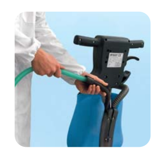
Periodic cleaning of the squeegee hose to ensure efficient suction